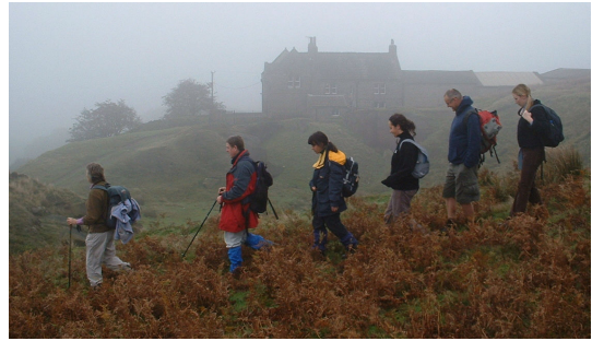
Ranger-led guided walk on Burley and Hawksworth Moor. 25 October 2006

During the course of the year, Leeds City Council was able to apply for funding through the Access Management Grant scheme. As part of this funding a temporary Open Access Ranger was appointed who could deal with the process of managing the interpretation / signs on open access land. It was envisaged that the second phase of this funding would cover costs to extend this new post.