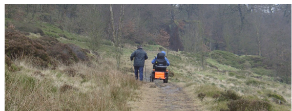
Test-driving Trumper scooters with the Otley Disability Advisory Group on the Chevin, 24 February 2006

The questionnaire survey was amended and agreed by members of the Forum who advised on the best way forward to implement this survey.