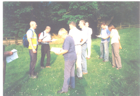
The local access forum site meeting at Parlington estate, 6 June 2006

Members of the Forum and attendance at the various meetings of the Leeds Local Access Forum can be seen in section 12.